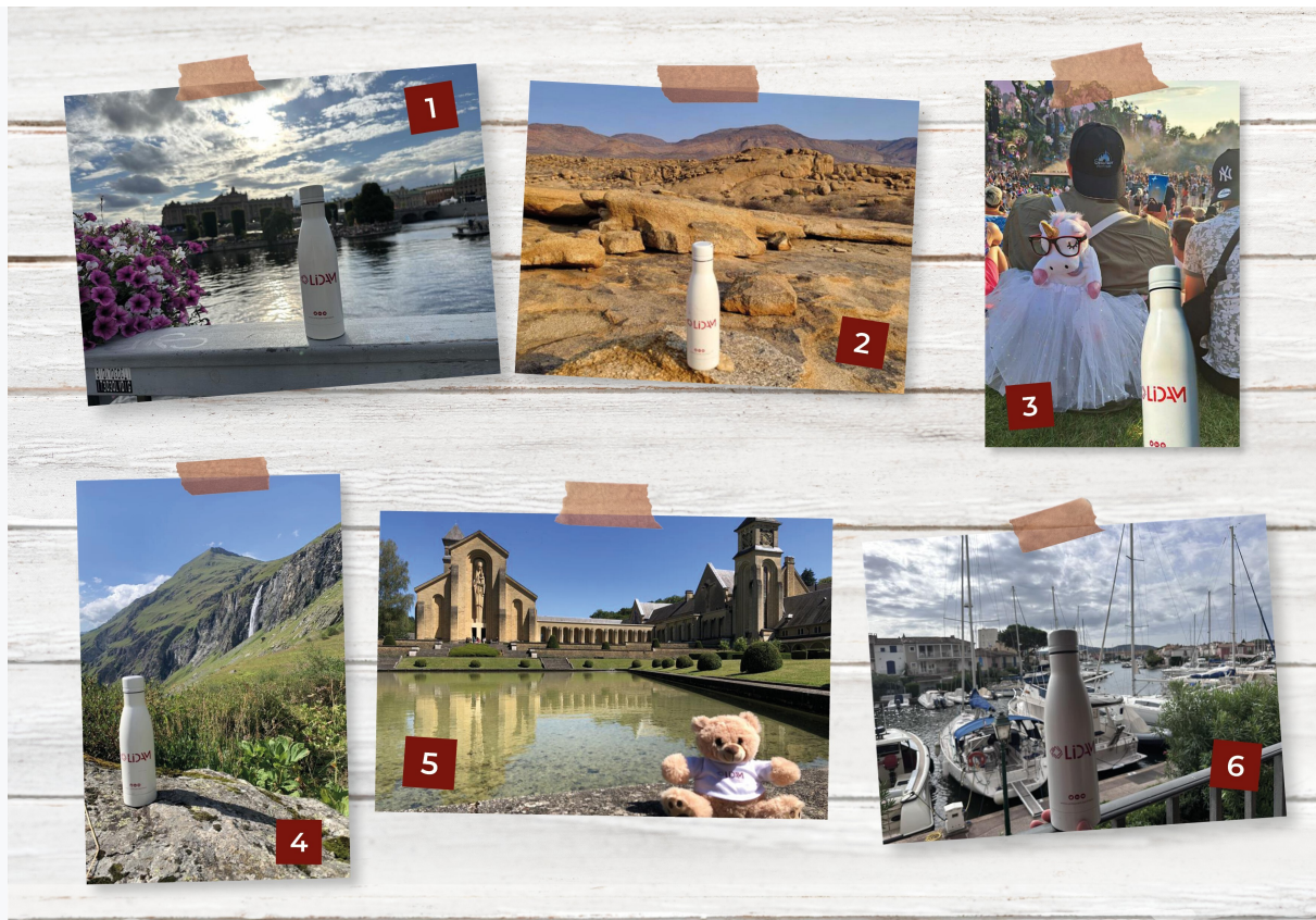
1. Photo © Elena Beffort, Stockholm, Sweden -- 2. Photo © Tatiana Regout, Namibia -- 3. Photo © Margaux Hubin, Tomorrowland, Boom, BE -- 4. Photo © Frédéric Vrins, Parc national de la Vanoise, FR -- 5. Photo © Marie Gonze, Orval, BE -- 6. Photo © Elena Beffort, Port Grimaud, FR